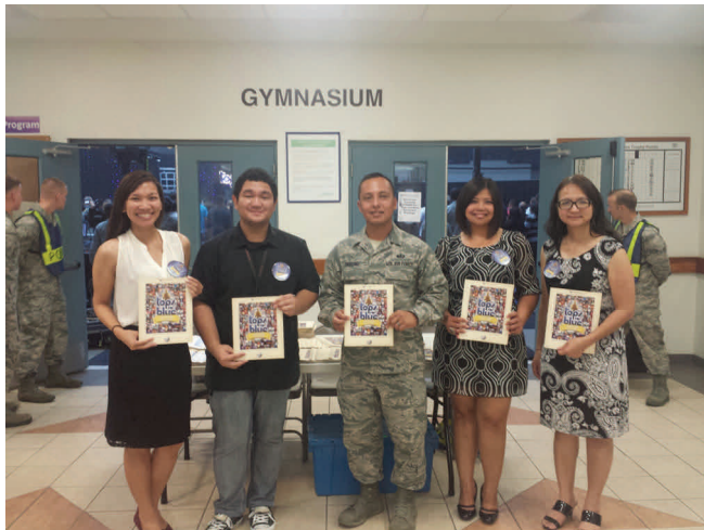
TOPS IN BLUE